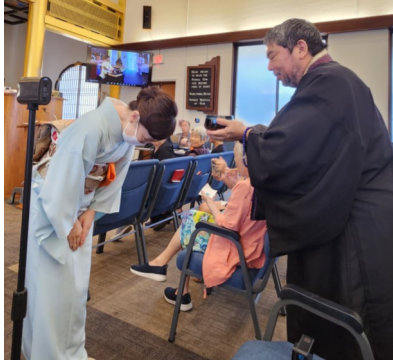
Omotesenke Domonkai Tea Ceremony demonstration