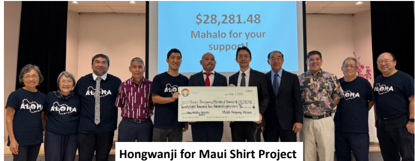
Hongwanji for Maui Shirt Project