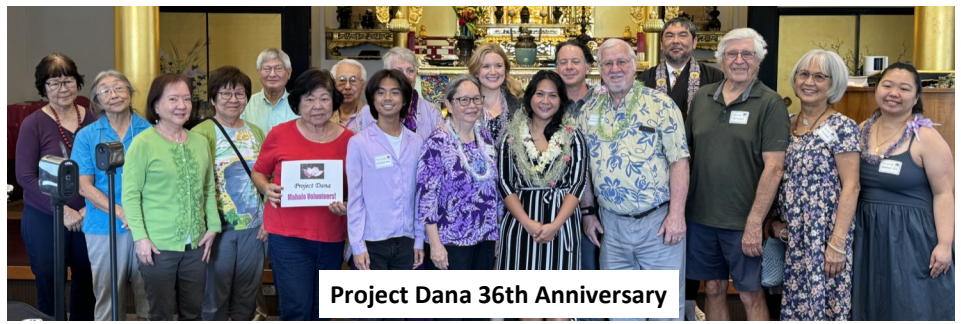
Project Dana 36th Anniversary