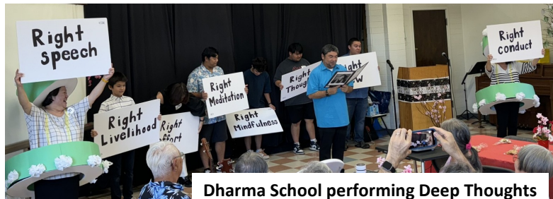
Dharma School performing Deep Thoughts